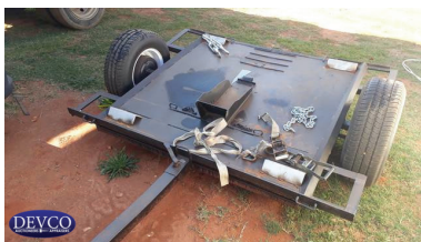
CAR DOLLEY TRAILER LOCATED IN JHB