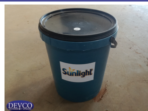
SUNLIGHT SOAP 20L BUCKET (HAND & AUTO) LOCATION IN JHB