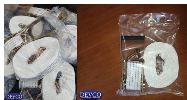
RATCHET & STRAP - 9M QTY: +/- 100 UNITS AVAILABLE LOCATION IN JHB