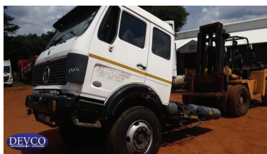
MERCEDES-BENZ 2635 6X4 MECHANICAL HORSE MAKE: MERCEDES-BENZ YEAR: 1994 REG: KYX077GP VIN: 62414626010829 COMMENTS: CHASSIS CUT OFF / ENGINE REMOVED LOCATED IN JHB