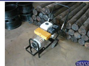
WAGNER AIRLESS 7000 HE W/HONDA GX160 MOTOR S/N: GC02-4487743 LOCATION IN JHB