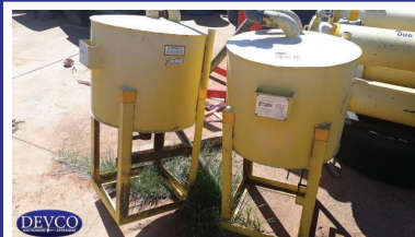
2 CYLINDER FILTRATION SYSTEM S/N: 23.07.2014 LOCATION IN JHB