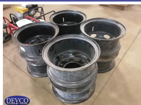
TRUCK RIMS X8 LOCATION IN JHB