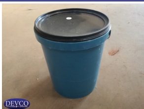
SURF SOAP 20L BUCKET (HAND & AUTO) LOCATION IN JHB