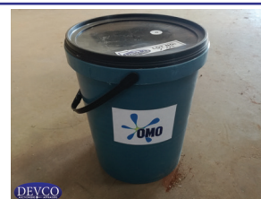
OMO SOAP 20L BUCKET (HAND & AUTO) LOCATION IN JHB