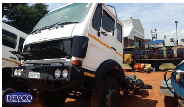
182 MERCEDES-BENZ 2628S 6X4 MECHANICAL HORSE YEAR: 1982 MAKE: MERCEDES-BENZ REG: HFN 443 GP VIN: 39718364856134 COMMENTS: CHASSIS CUT OFF / ENGINE & TRANSMISSION REMOVED LOCATED IN JHB