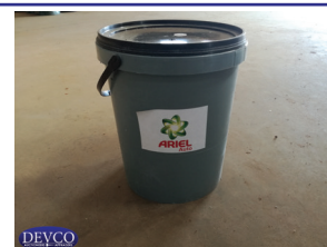
ARIEL SOAP 20L BUCKET (HAND & AUTO) LOCATION IN JHB