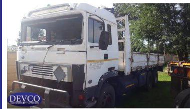
ERF 4X2 DROPSIDE TRUCK YEAR: 1989 REG: PMB 161 GP VIN: AAPV0030050236822 COMMENTS: NON RUNNER / ENGINE & TRANSMISSION REMOVED / NO PAPERS LOCATED IN JHB