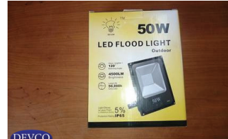
50WATT LED LIGHT QTY: 10 LOCATION IN JHB