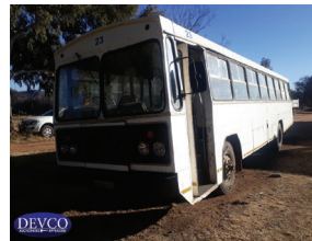
NISSAN 21 SEATER BUS REG: FNC565FS CALL FOR LOCATION