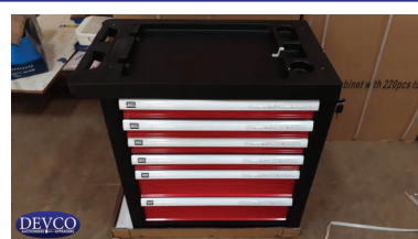
MOBILE TOOL BOX - WITH TOOLS S/N: CD-3060 QTY: 27 LOCATION IN JHB